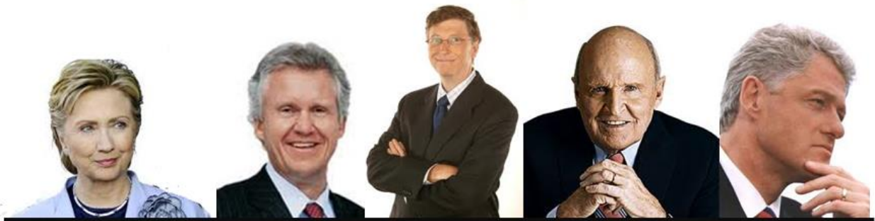
HILLARY CLINTON Former Senator, United States Of America IIT 2007 Keynote